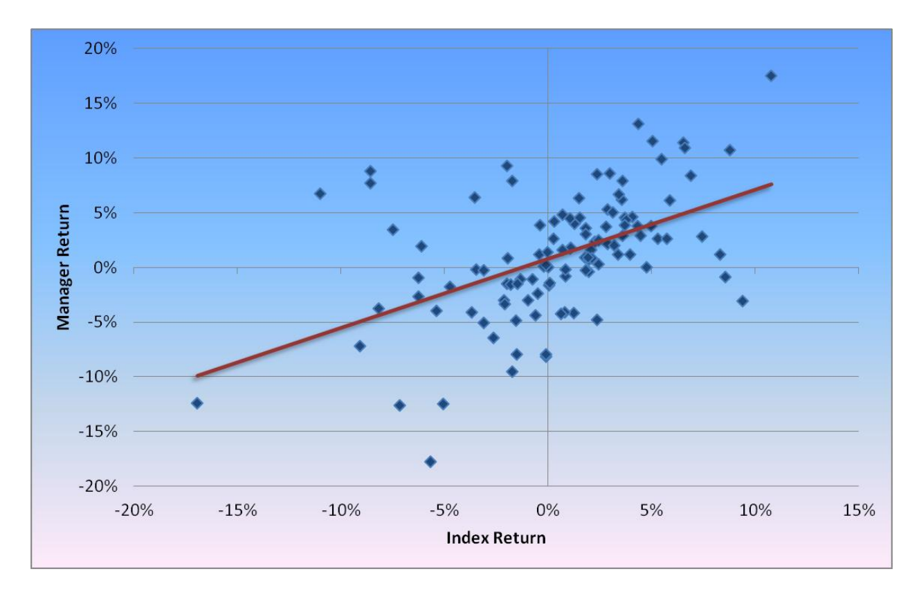
Figure 3: Scatter plot of returns for S&P 500 Index and an equity manager, with linear regression line showing a positive slope (correlation)

(or lower) the PC, the stronger this relationship is. A PC near zero indicates little to no correlation between the data. Note that PC describes linear relationships only and will give no useful information about non-linear correlation (which would be a curved line in the example above).