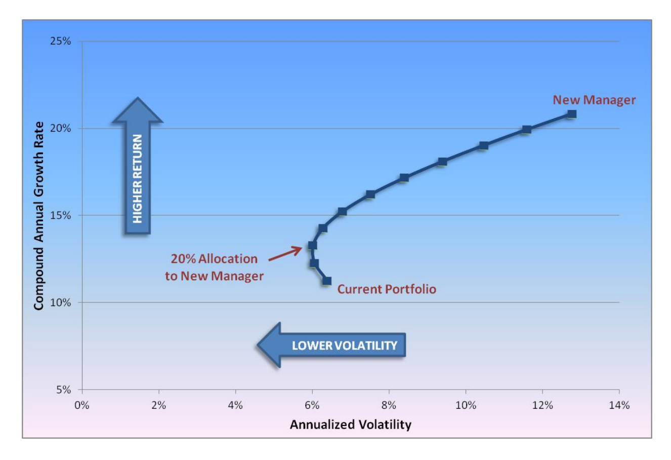
Figure 4: Effect of adding new manager to existing portfolio in 10% increments – 20% allocation optimizes risk/return ratio

The "efficient frontier" refers to the optimized portfolio that can, through the proper diversification, theoretically produce a higher return per unit of risk than a single investment. In other words, the portfolio is optimizing for the highest Sharpe Ratio (see Figure 4).